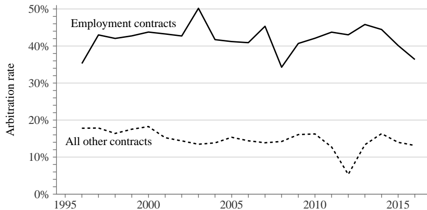
FIGURE 2: SHARE OF CONTRACTS WITH ARBITRATION PROVISIONS

definition. Answering these questions with machine learning protocols would effectively enable scholars to apply (rudimentary) legal reasoning at scale. Thus, the challenge for the emerging literature that applies machine learning techniques is to resist the temptation of low-hanging questions lying at the extremes, and instead develop methods for addressing the more stubborn, yet perhaps more fruitful, questions that live in the middle.