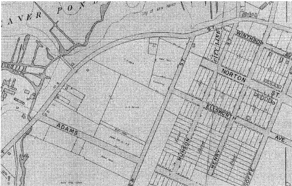
Figure 1. MAP OF BEAVER HILLS IN 1911

year. 21 But a 1911 city atlas shows that the basic street plan proposed by the Company in its 1908 subdivision map had been executed in those three years. 22 By 1911, seventeen houses had already been built within the area of the original subdivision. 23