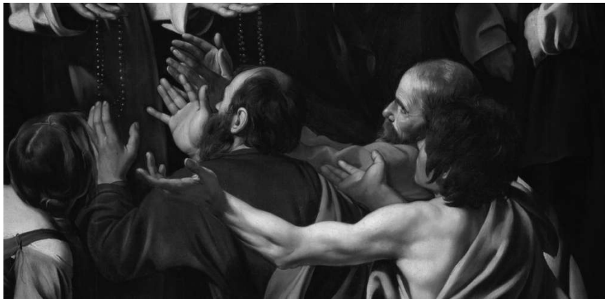
Michelangelo Merisi ("Caravaggio"), Madonna of the Rosary (Detail), 1607, Kunsthistorisches Museum, Vienna, Austria; photo © KHM-Museumsverband.