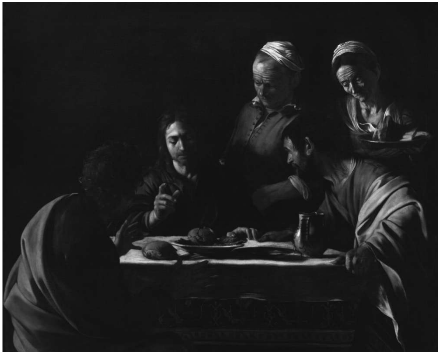
Michelangelo Merisi ("Caravaggio"), Supper at Emmaus , 1606, Pinacoteca di Brera, Milan, Italy; photo © Pinacoteca di Brera.