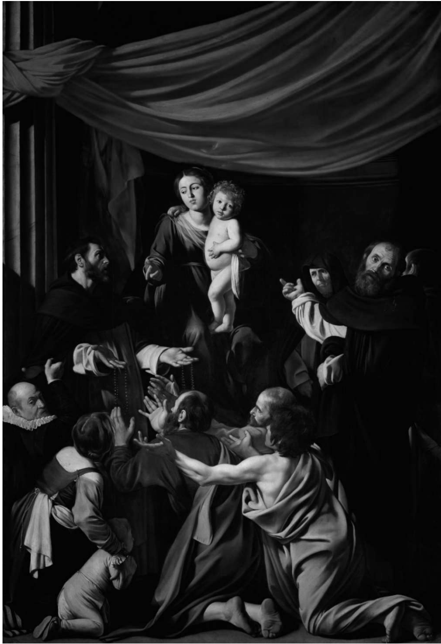
Michelangelo Merisi ("Caravaggio"), Madonna of the Rosary , 1607, Kunsthistorisches Museum, Vienna, Austria; photo © KHM-Museumsverband.