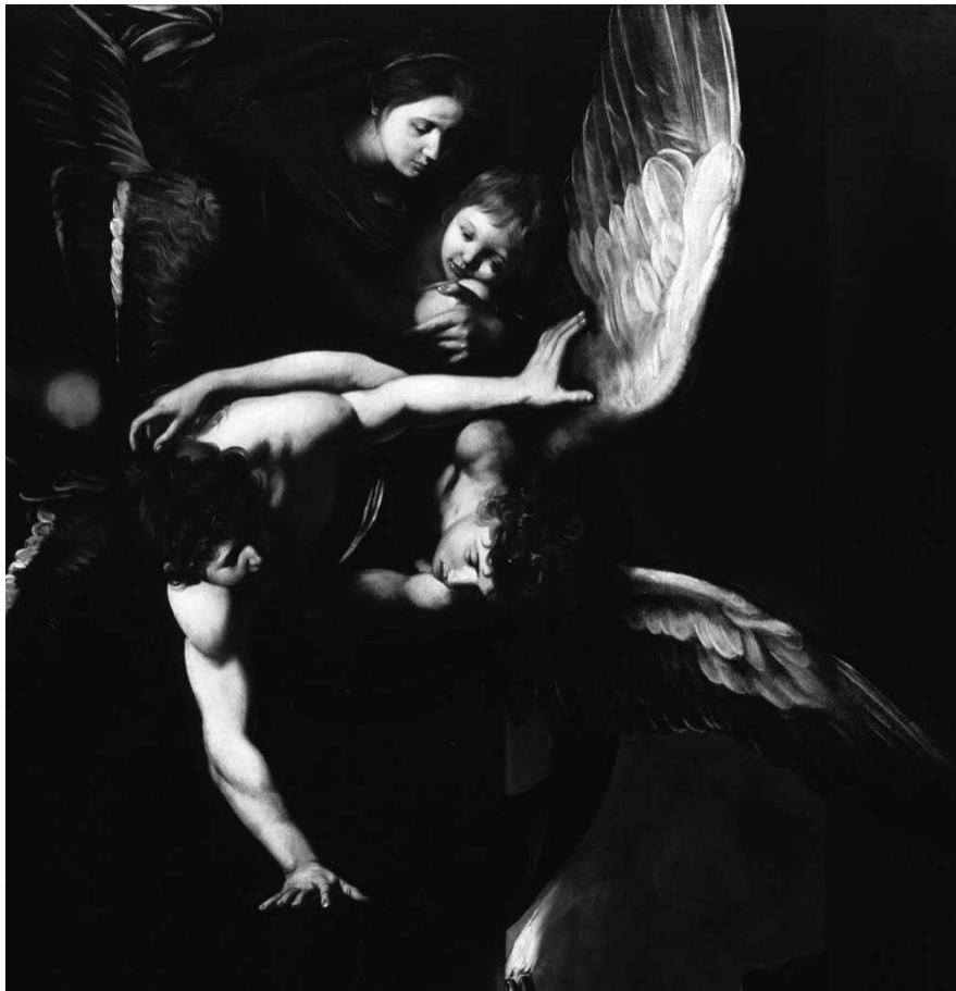
Michelangelo Merisi ("Caravaggio"), The Works of Mercy (Detail), 1607, Pio Monte della Misericordia, Napoli, Italy; photo © Luciano Pedicini / Archivio Fotografico del Pio Monte della Misericordia.