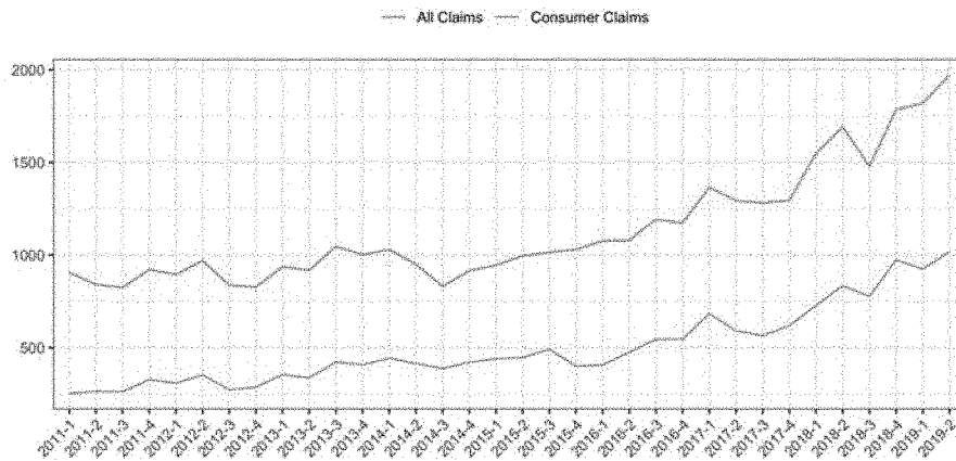
Figure 2: Total Claims and Total Consumer Claims, Individual Only (Excluding 50 Claims or More Filed by the Same Firm Against the Same Provider)

Having identified these coordinated or collective efforts, we return to our focus on individual filings. Therefore, in the data accounting below, we removed instances when fifty or more claims were filed by the same attorney against the same provider. We then assessed the number of claims per year. As the chart shows, the total numbers of non-consumer and consumer claims are modest (peaking at 1,971 claims in a quarter), and the number of consumer filings has, since 2011, increased.