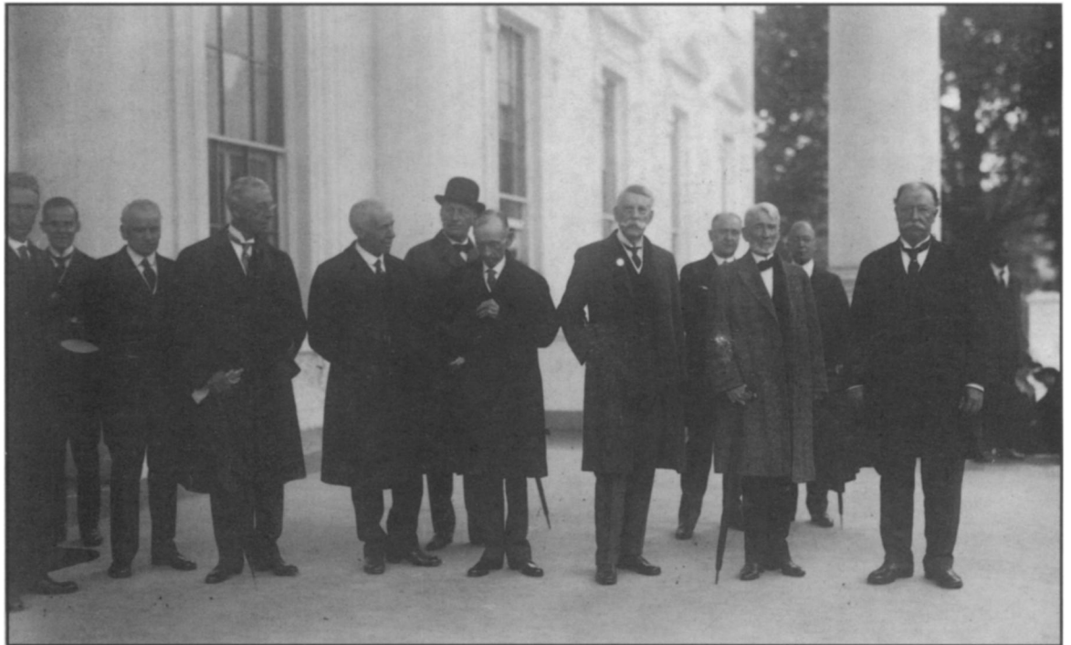
The Taft Court visits the White House, circa 1921-22.

Second, if judges are “cogs in a machine,” there must also exist some intelligence that directs the machine. Organizations require guidance, and the functional unification of the judiciary thus implied that the judicial branch be subject to “the executive management” of “a head charged with the responsibility of the use of the judicial force at places and under conditions where judicial force is needed” (21). In this way the act transformed the federal judiciary from an “entirely headless and decentralized” (22) institution into one capable of “executive supervision” (23).