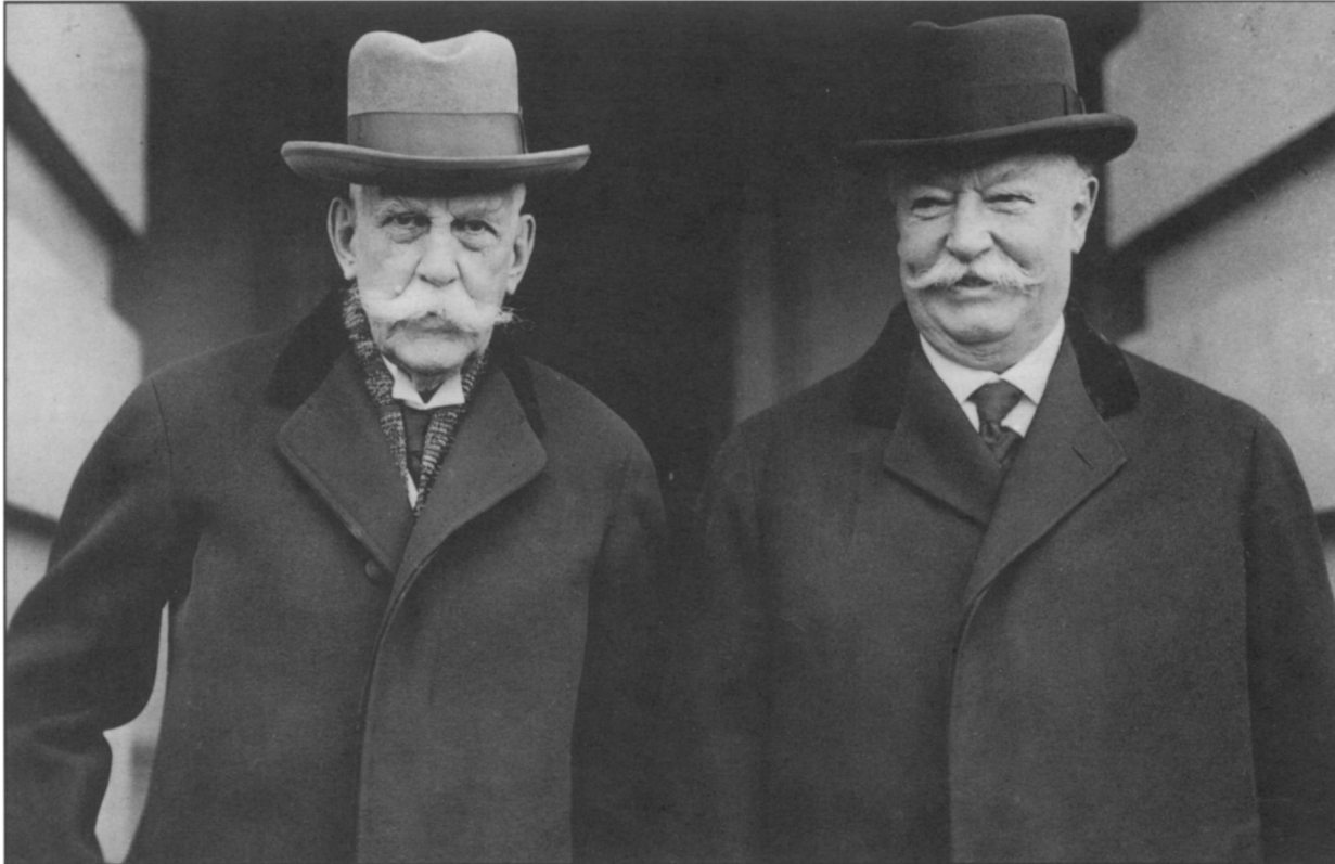
Oliver Wendell Holmes and William Howard Taft.

an independent lobbyist for a legislative agenda, much as he would have as chief executive.